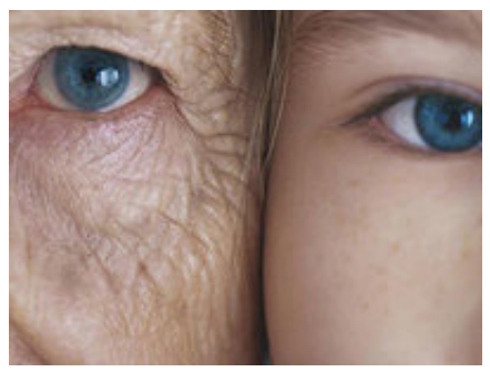
60 Year Old Mum Outsmarts Doctors, Reduces 20 Years of Wrinkles in Weeks For $4.95 2 weeks ago skintips.co Skin Tips SkinTips.co (sponsored) by Gravity