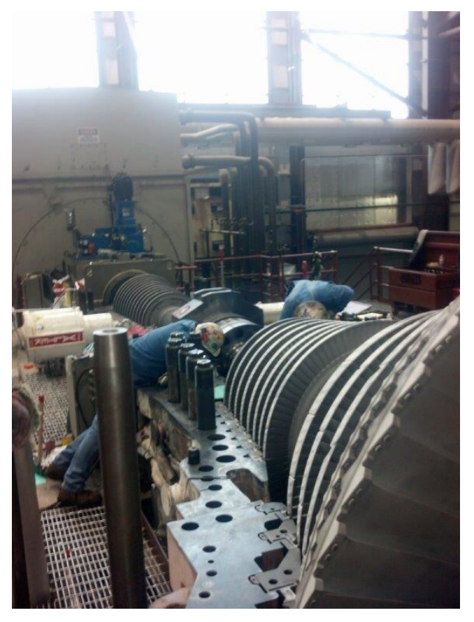
Maintenance of the steam turbine at Faribault Energy Park [130].

Feedwater systems can be inspected and worked on while the plant is in