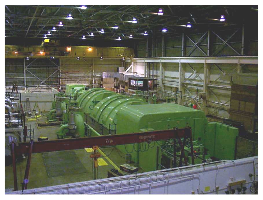
Monticello nuclear generating plant turbine deck [29].

It may seem strange that in the Rankine cycle the steam is first cooled down so that it condenses into liquid water and then is heated back up to create steam. This is done because liquid requires much less energy to move than vapor. Because pumps are much more efficient than compressors, the energy consumed by a pump to move the liquid water is negligible compared to the overall amount of energy produced by the system.