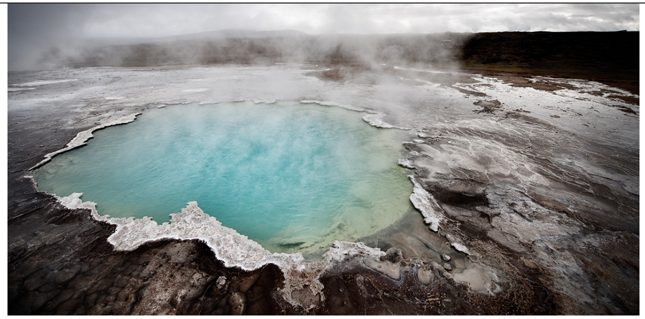
There are documented occurrences of hydrogen in geothermal brines

Historically, natural hydrogen has been ignored due to the persistent misconception that it rarely occurs naturally – a view that largely prevailed despite the fact that since the beginning of the 20th century geoscientists have documented natural hydrogen, both in sedimentary and non-sedimentary (igneous) geological settings, often in non-negligible volumes. For instance, over a century ago, Ernst Erdman documented the flow of 128 cubic feet of hydrogen per day for 4.5 years at Leopoldshall Salt Mine in Strassfurt, Germany (Erdmann, 1910). Yet, natural hydrogen did not capture the interests of explorers until recently. The narrative changed in 2012 when Hydroma Inc. (a Canadian company previously known as Petroma Inc.) rediscovered a hydrogen to the surface in commercial quantities. It then became clear that we could no longer ignore natural hydrogen.