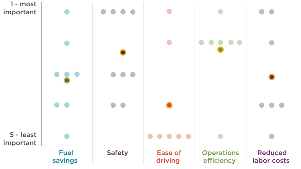
Figure 1. Survey responses: Motivations for developing or researching autonomous trucking technologies.

Contrasting the results from the 10 telephone interviews from the conversations with the five Run on Less trucking fleets, we found somewhat of a divergence in opinion as to the value of truck automation technologies in