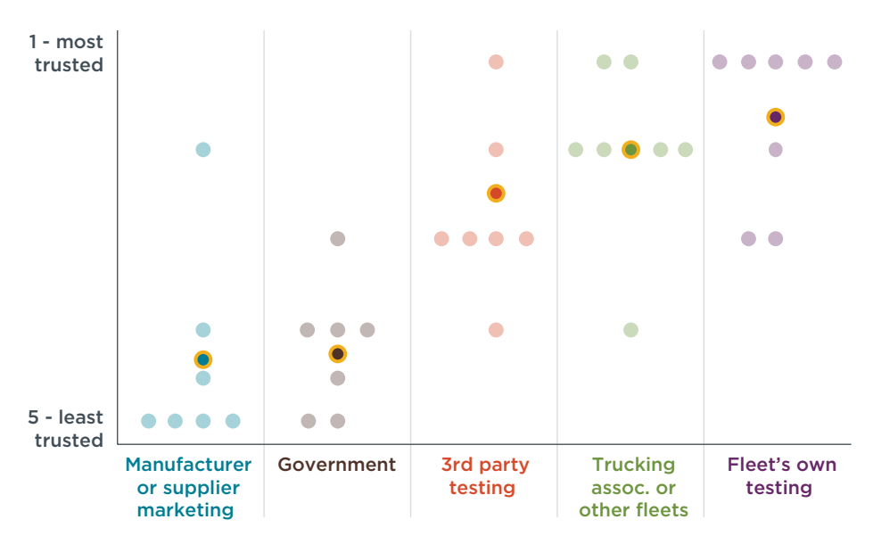
Figure 4. Survey responses: Level of trust of various sources of information when acquiring information about new technologies.

Federal regulations. Focusing on the United States,1 policies explicitly targeting autonomous vehicles including both passenger cars and commercial vehicles are in their infancy. There is currently a patchwork of 11 states and jurisdictions that have different regulations that affect autonomous operations including, in some instances, platooning. Nearly all of the interviewees discussed the urgent need for a strong regulatory program at the federal level that provides a robust framework for vehicle certification, safety requirements, and operating protocols. Moreover, in the case of platooning systems, which are in the early stages of commercial deployment, several participants stated that a federal standard for minimum following distance that supersedes the various state regulations would be a boon to both manufacturers and fleets in accelerating the uptake of this technology application.