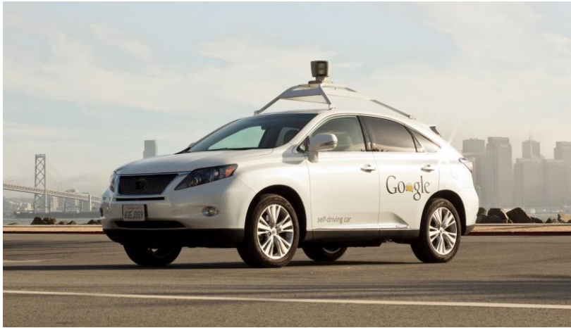
Exhibit 2: Google Driverless Car

Level 4 vehicles would require no human driver for operation and indeed could operate without any occupants. Networks of shared, taxi-like AVs with intermediate trips by unoccupied vehicles would require AVs of Level 4 capability. As of 2014, no Level 4 vehicles exist. Estimates of when they would be developed range from 2025 to 2050. Possible adoption timelines are discussed further in Section 2.