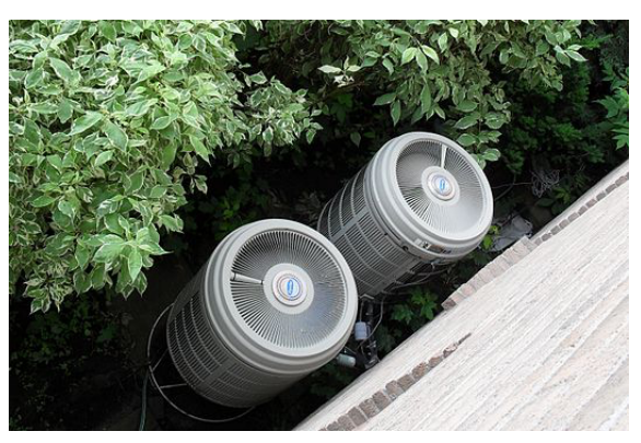
Outdoor components of a residential airsource heat pump

A heat pump is a device that transfers heat energy from a source of heat to what is called a thermal reservoir. Heat pumps move thermal energy in the opposite direction of spontaneous heat transfer, by absorbing heat from a cold space and releasing it to a warmer one. A heat pump uses external power to accomplish the work of transferring energy from the heat source to the heat sink.<sup>[1]</sup> The most common design of a heat pump involves four main components - a condenser, an expansion valve, an evaporator and a compressor. The heat transfer medium circulated through these components is called refrigerant.<sup>[2]</sup>