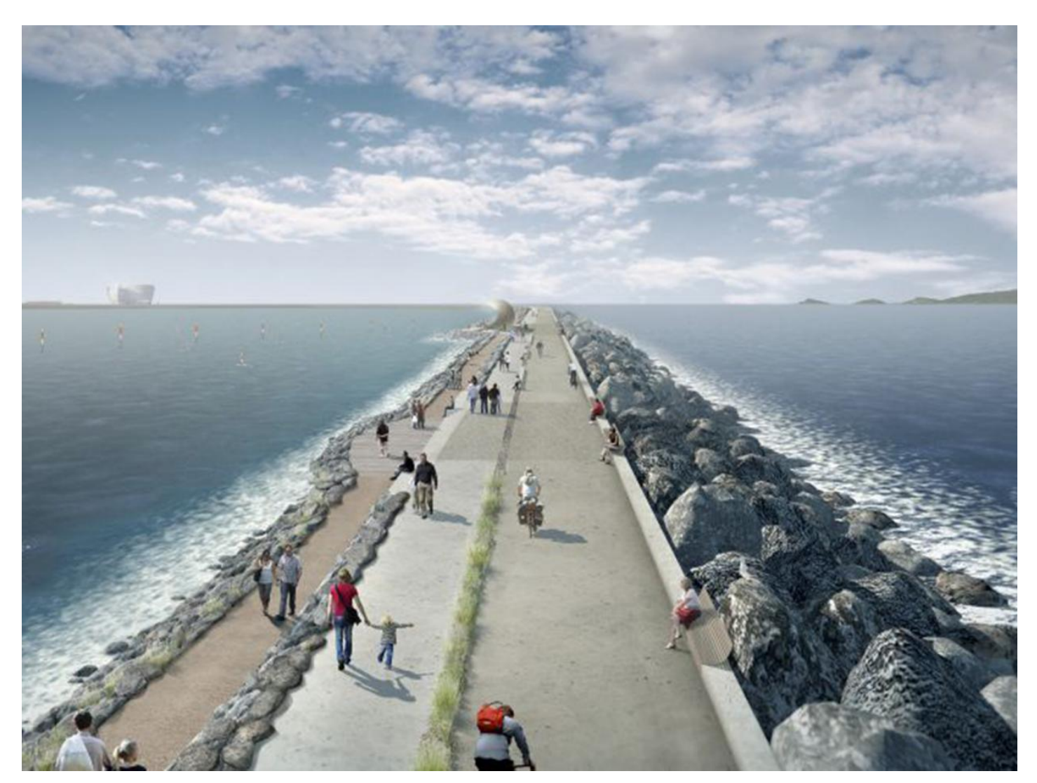
Tidal Lagoon Power company is building its first tidal power project in Swansea PA