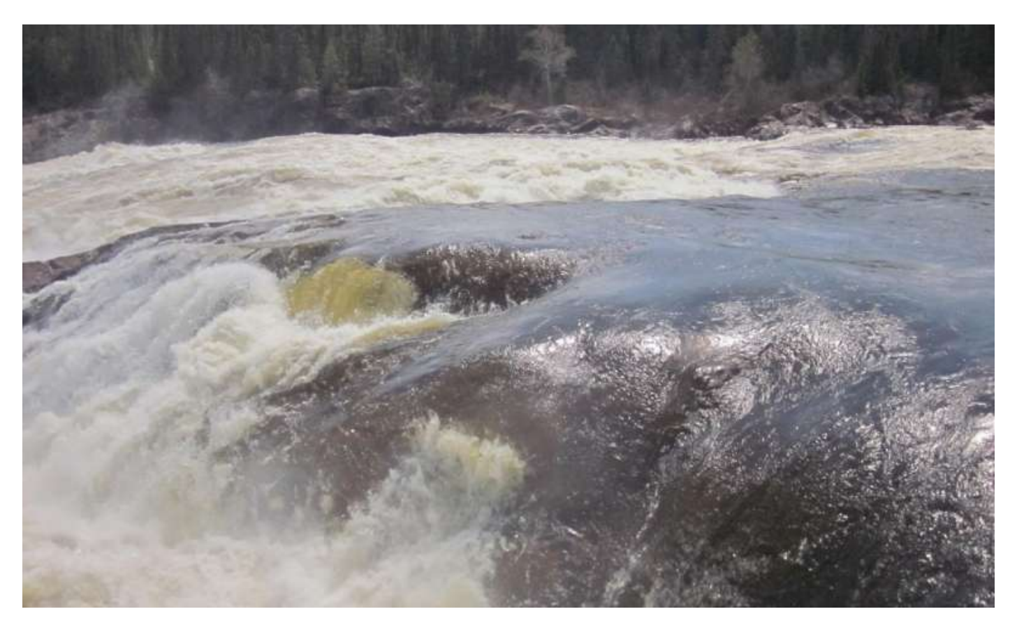
Muskrat Falls in Labrador Canada is the site of the upcoming Muskrat Falls hydroelectric facility.